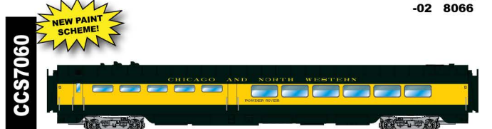
Chicago & North Western (1 number)