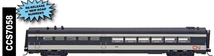
Canadian National (2 numbers)

Car Numbers: -01 Golden Chalice -03 Golden Vland