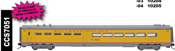
Southern Pacific - City of San Francisco (1 number)

Car Numbers: -03 1150 Lake Superior -04 1152 Lake Chelan