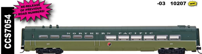
Northern Pacific (2 numbers)