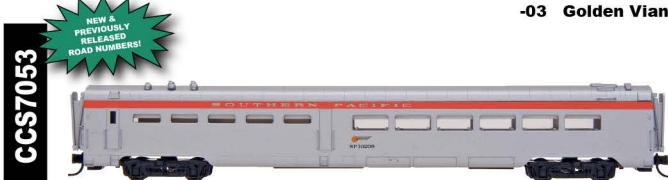
Southern Pacific - Sunset Ltd (2 numbers)