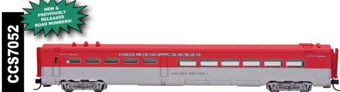
Southern Pacific - Golden State (2 numbers)

Car Numbers: -01 Golden Chalice -03 Golden Vland