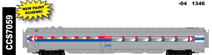
Amtrak (2 numbers)