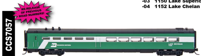
Burlington Northern (1 number)