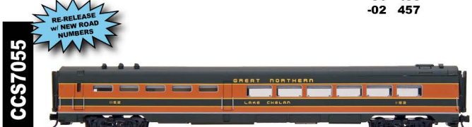
Great Northern (2 numbers)

Car Numbers: -03 1151 Lake McDonald -04 1153 Lake Josephine