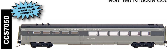
Southern Pacific - Overland (2 numbers)

Announced: December 9 Reservations Due By: January 31 Available: July / August Features: Sharp Painting and Lettering, Wire Grab Irons, Interior Details, Interior Lighting, Available in Multiple Names & Numbers, Equipped with Operating Truck Mounted Knuckle Couplers.