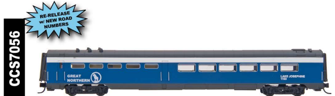
Great Northern - Big Sky Blue (2 numbers)

Car Numbers: -03 1150 Lake Superior -04 1152 Lake Chelan